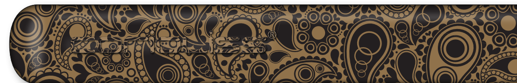
GOLD PAISLEY - SUK 1022