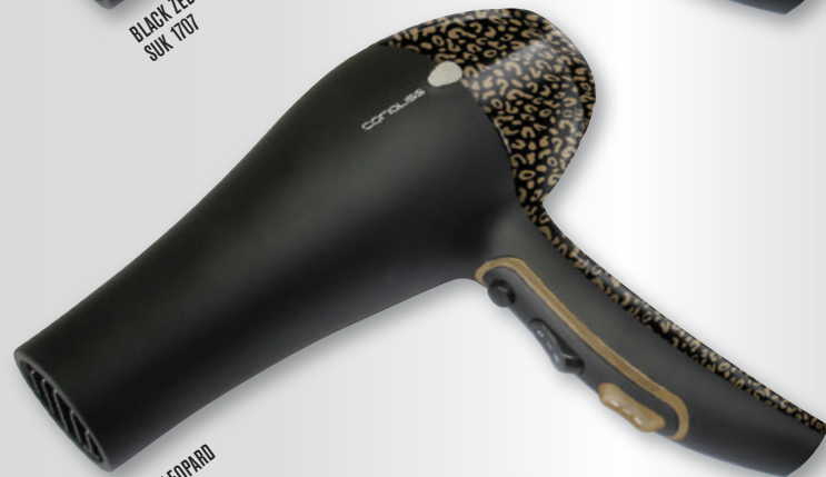
GOLD LEOPARD SKU 1708