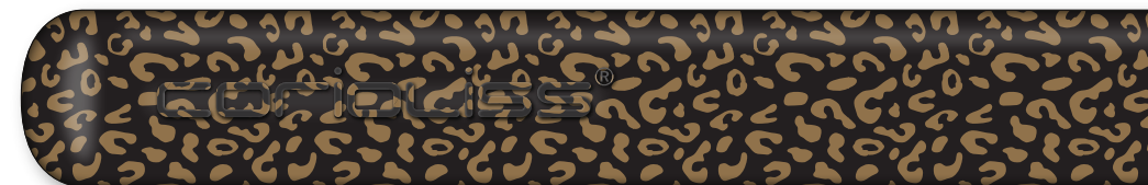
GOLD LEOPARD - SUK 1023