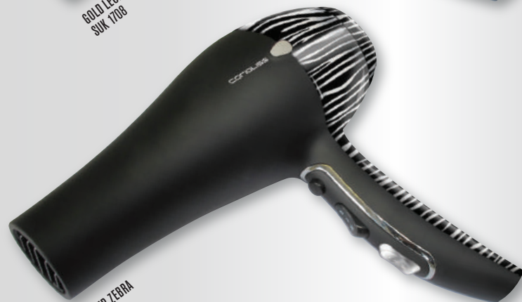
SILVER ZEBRA SKU 1710