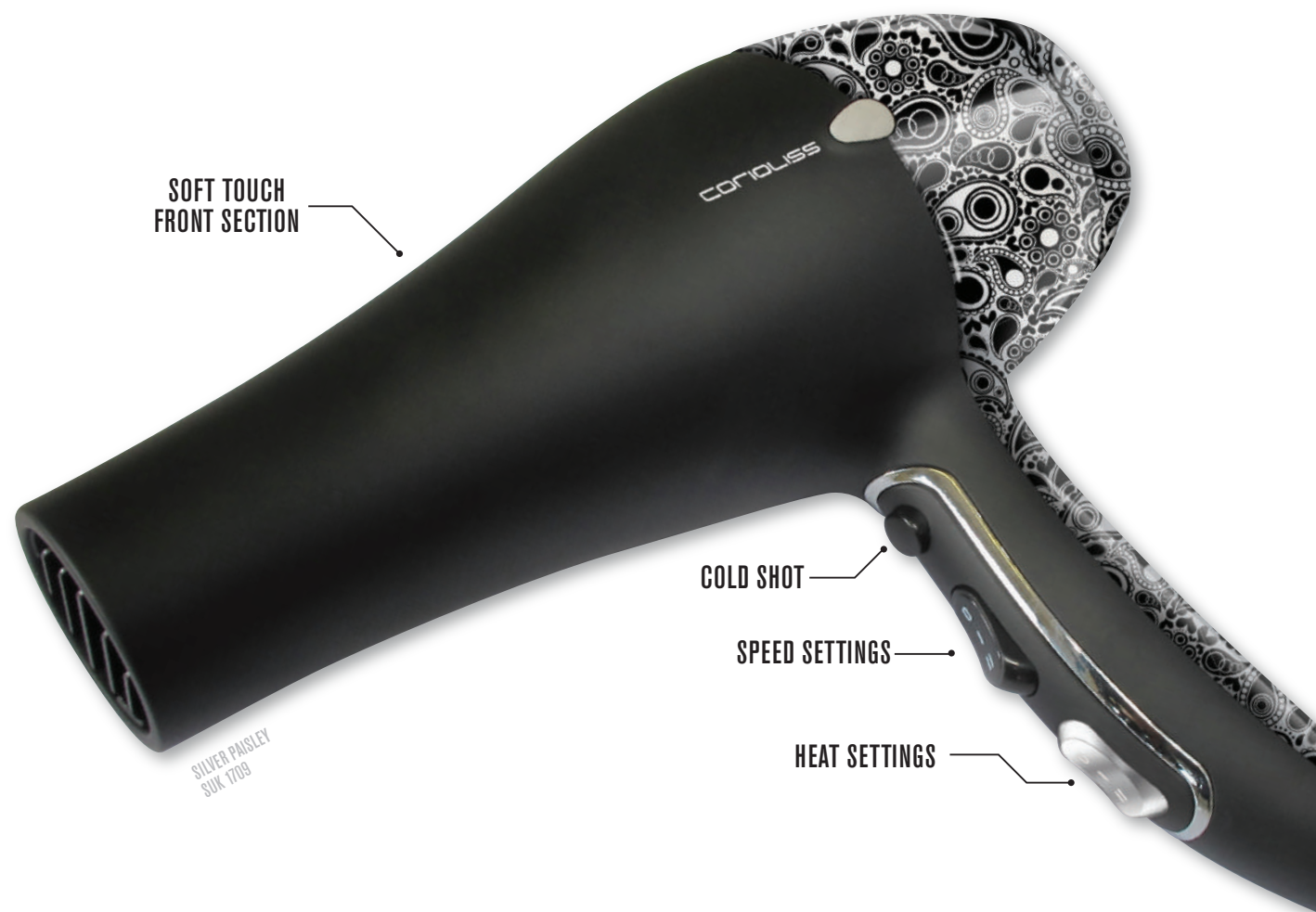
SOFT TOUCH FRONT SECTION