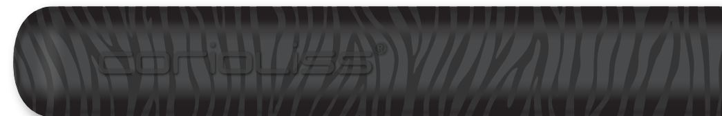
BLACK ZEBRA & METALLIC COPPER - SUK 1025