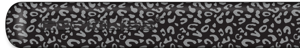
SILVER LEOPARD - SUK 1024