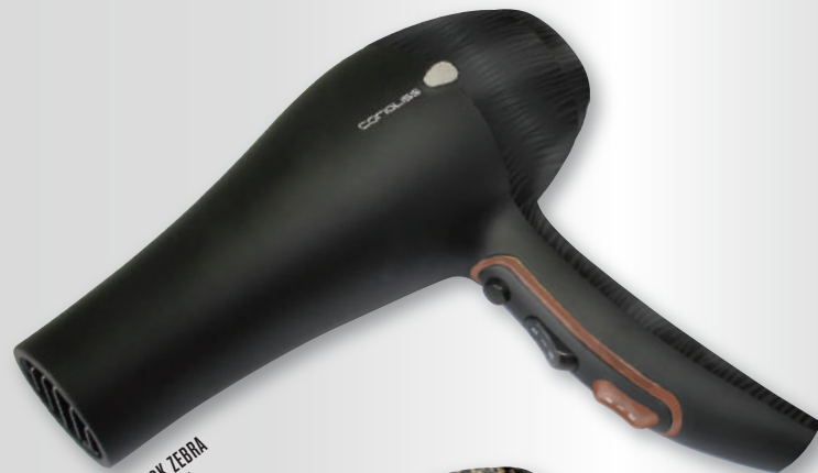
BLACK ZEBRA SKU 1707