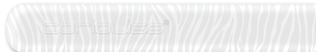
WHITE ZEBRA & METALLIC COPPER - SUK 1026

SALON STYLE CORD professional tangle-free cable for greater freedom. 360° Swivel base allows better movement.